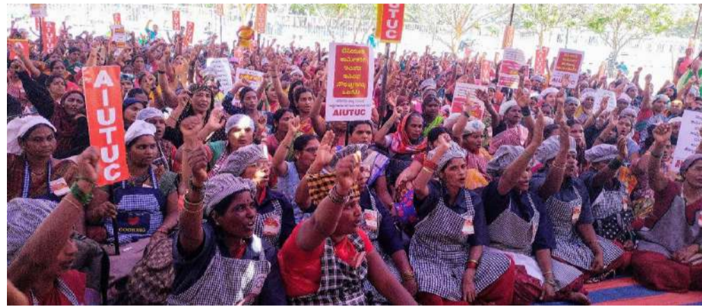
'Karnataka Rajya Samyukta Akshara Dasoha Karmikara Sangha' (Midday meal workers), affiliated to AIUTUC, in a rally in Bangalore on 15 February voicing various legitimate demands including their eligibility to get stipulated minimum wage.